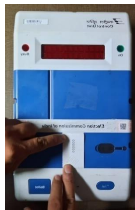
Affixing Green Paper Seal