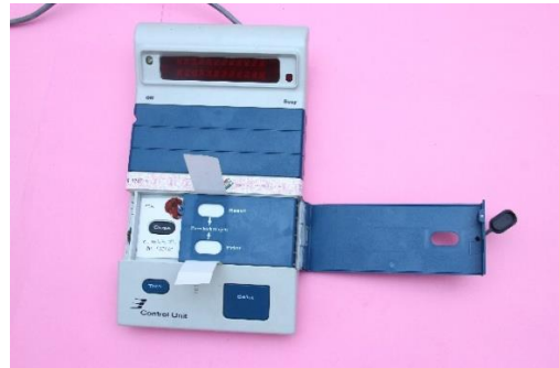
Sealing inner Result Section with Special Tag