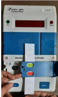
Fixing Green Paper Seal